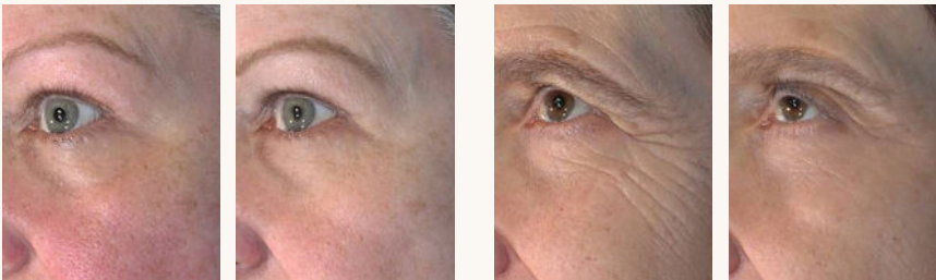
After three treatments.